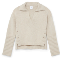
G. LABEL BY GOOP Jacob Polo-Collar Sweater goop, $178.50 SHOP NOW

Fall is an excellent time to visit Mallorca, with temperate weather and the water still warm enough for a dip. Dress in layers to prepare for any shifts in temperature—it can get a little chilly in the mountains.