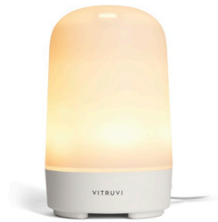
VITRUVI Glow Diffuser goop, $26 SHOP NOW

“It’s hard to top the vitruvi Stone Diffuser , but I have recently fallen in love with a new member of the family: the vitruvi Glow Diffuser. This compact diffuser doubles as a soft ambient lamp and creates the ultimate relaxing vibe. Another brilliant design feature is the fact that you can control the mist direction by twisting the lid. Other diffusers I own only mist from the top, but my Glow Diffuser is enclosed between two shelves on a bookcase, and I like that the mist can go out instead of up.”