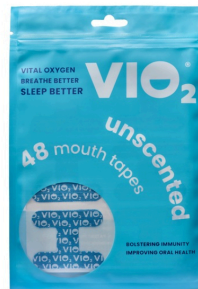
VIO2 Mouth Tape goop, $26.95 SHOP NOW

“I love sleeping. Like, deeply and passionately. And I’m always looking for ways to do it better. So I was intrigued by the idea of mouth taping: It forces you to breathe through your nose throughout the night—which, proponents of the practice say, may help you get a better night’s sleep. I was apprehensive about what it would feel like, physically and psychologically. You can wear the tape with the tabs extending vertically and the middle strip sealing the opening of your lips (this orientation was not comfortable for me, psychologically), or with the tabs running parallel to your lips and the middle strip extending vertically across your top and bottom lips (for me, this felt very comfortable and nonrestrictive). Whichever way you wear it, my advice is to do your skin-care routine a bit earlier in the evening to give the creams and oils time to sink in before you apply the tape. I didn’t see a huge difference in my Oura sleep scores on the nights I slept with my mouth taped. But I did feel like I slept more solidly, with fewer disruptions, throughout the night. If I woke up in the early hours of the morning, I didn’t stay awake long enough to remember it. For me, it’s been an enjoyable add-on to my nightly routine, and a practice I plan to continue.”