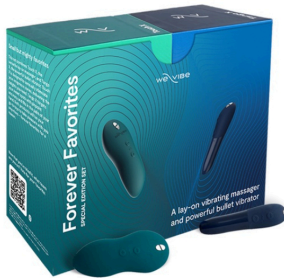
WE-VIBE Forever Favorites goop, $149 SHOP NOW

“ We-Vibe really came through with this set. I like the Touch X because it delivers the sensation of a palm vibrator (which is generally my preference), but it has a slimmer shape than most others I’ve tried, so it’s like holding a light remote control in your hand. You can press the shallow cup against your vulva for that broad palm sensation, but you can also use the tip for more-targeted clitoral stimulation (which doesn’t really work with most other palm-size vibrators, in my experience). And then the Tango X is kind of wild because it’s tiny—like a finger—but it visibly rocks. I can’t think of another bullet vibrator that’s close to as strong as this one.”